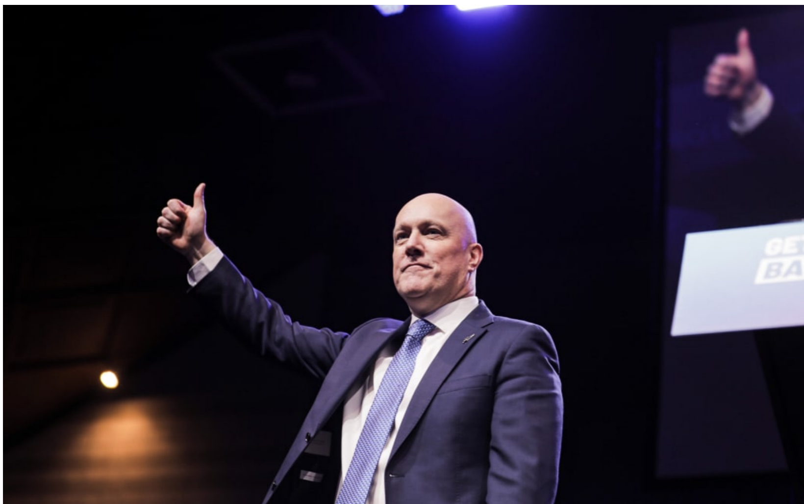
National Party leader Christopher Luxon at the party's launch of its 2023 election campaign.

The National Party has unveiled an election year pledge card, listing eight of its priority promises.